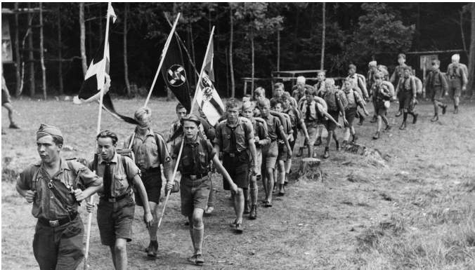
A group of boys leaving camp for a hike at a Hitler Youth summer camp in Berlin, 1933.

The Boy Scout was harassed and then attacked by a group of Nazi Youth. In an attempt to force him to join, one of the members stabbed him in the hand. Ebel fought back, grabbed the knife, and cut the other boy's face. Later, realizing his life was in danger, he escaped Germany and eventually became a U.S. citizen. Ebel was just one of millions of young Germans whose lives were changed by the Hitler Youth—a group designed to indoctrinate kids into Hitler's ideology, then send them off to war.