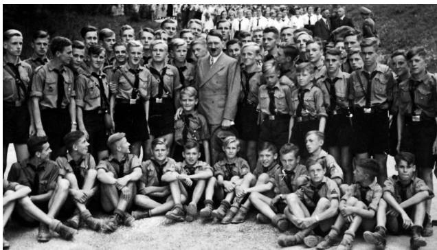
Adolf Hitler with Nazi party Hitler Youth at a 1935 gathering.

But over time, the activities changed. Though girls’ groups focused on things like rhythmic gymnastics and winter coat drives, the boys’ groups became more like a mini military than a Boy Scout den. They imposed military-like order on members and trained young men in everything from weapons to survival. And all groups included hefty doses of propaganda that encouraged an almost religious devotion to the Führer.